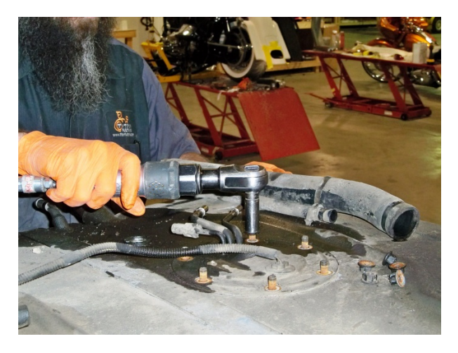
(Fig. 1) Loosen the bolts holding the sending unit into the OEM tank.