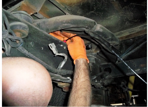
(Fig. 4) Be sure to attach Grounding Wire to one of the studs holding the sending unit.

(Fig. 5) The other end of the Grounding Wire must be attached to a bolt on the vehicle frame.