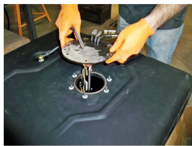
(Fig. 2) Carefully place the OEM sending unit into the new TITAN<sup>™</sup> replacement tank.